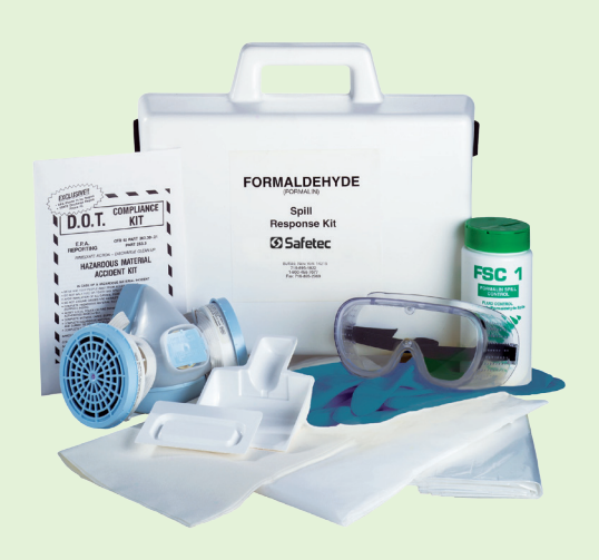
Formaldehyde Spill Response Kit (Hard Case)