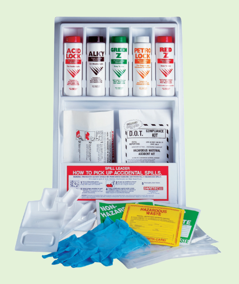
Spill Leader Kit