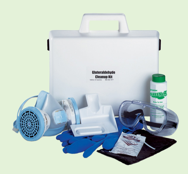
Glutaraldehyde Spill Kit (Hard Case)