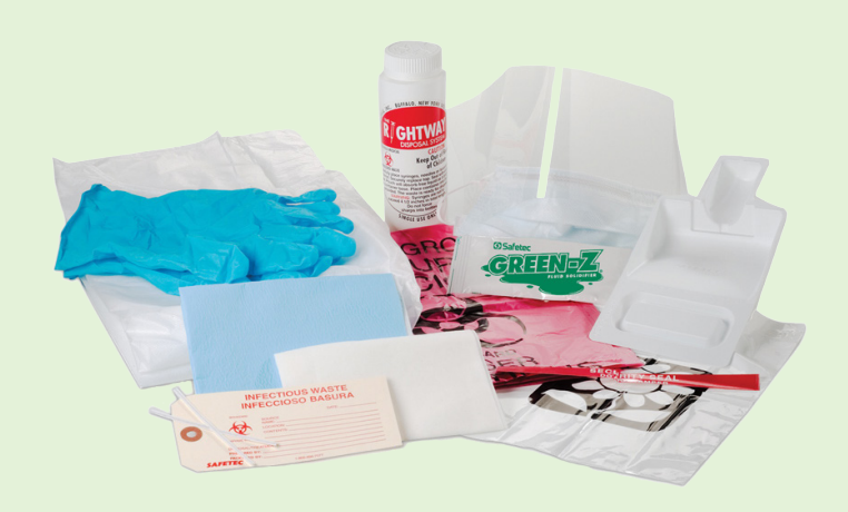
Chemotherapy Spill Response Kill (Refill)