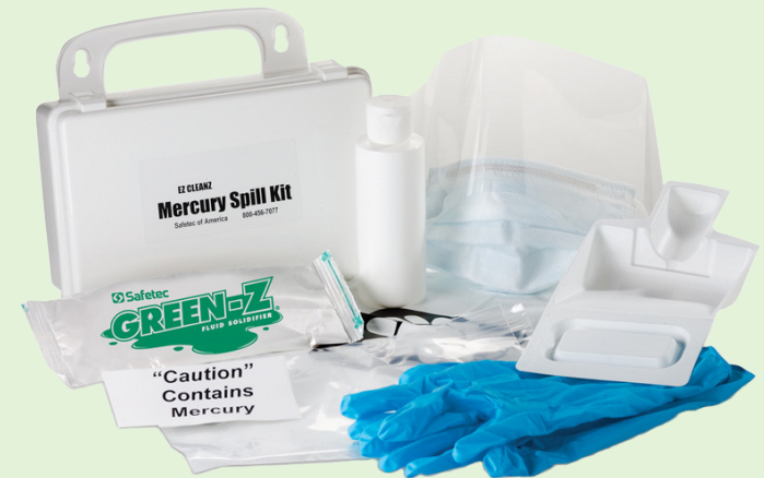
EZ Cleans Mercury Spill Kit (Hard Case)